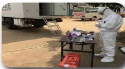
MD-Box-Lab In Africa